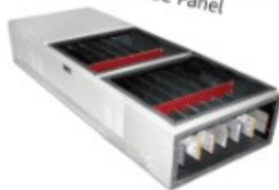
Air Insulated Rising Main Bus Duct upto 8000 Amp.