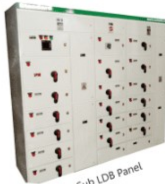
Sub LDB Panel