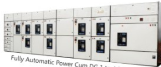
Fully Automatic Power Cum DG 1 to 4 PCC Panel