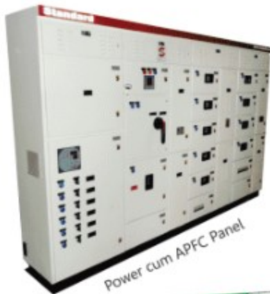
Power cum APFC Panel