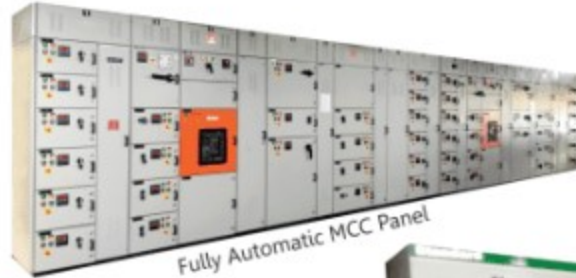
Fully Automatic MCC Panel

Modular power Switchboards and control panels complete with all is (International standards).