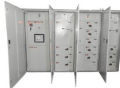
Out Door, Double Door IP 65 PCC Panel