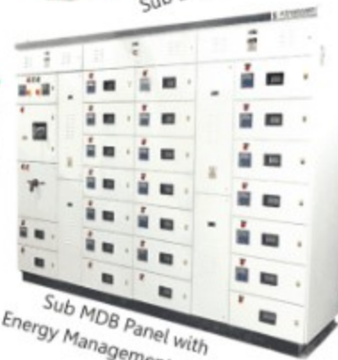
Sub MDB Panel with Energy Management System