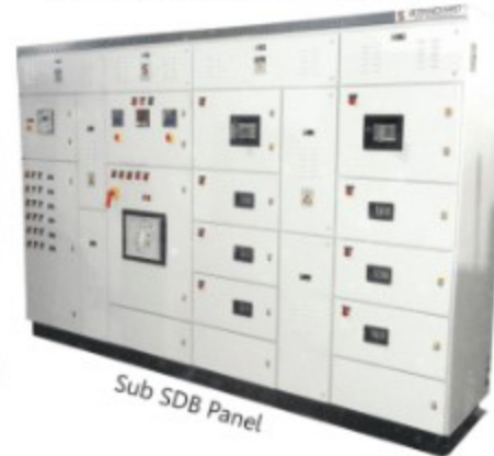
Sub SDB Panel