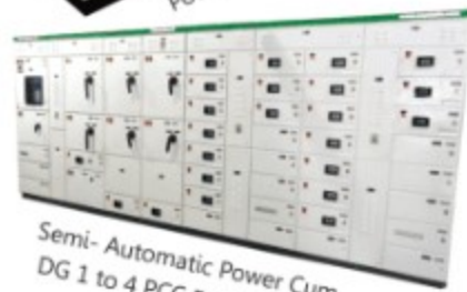
Semi-Automatic Power Cum DG 1 to 4 PCC Panel